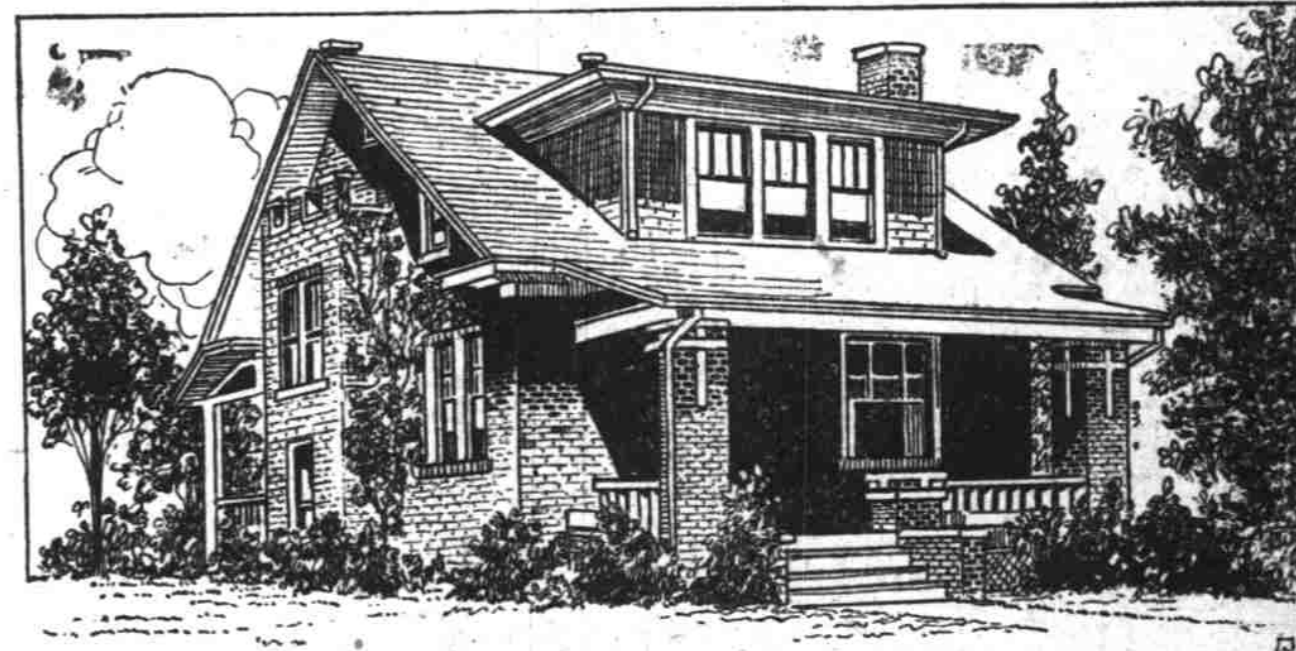
THE MONETA—DESIGN A639

Every once in a while you see an exceptionally attractive semi-bungalow and wonder just what the interior arrangement may be. Whether it is possible to make it as cozy within as it is snappy without. For some of this type of homes are about all that could be desired so far as appearance goes. This is one of that class.