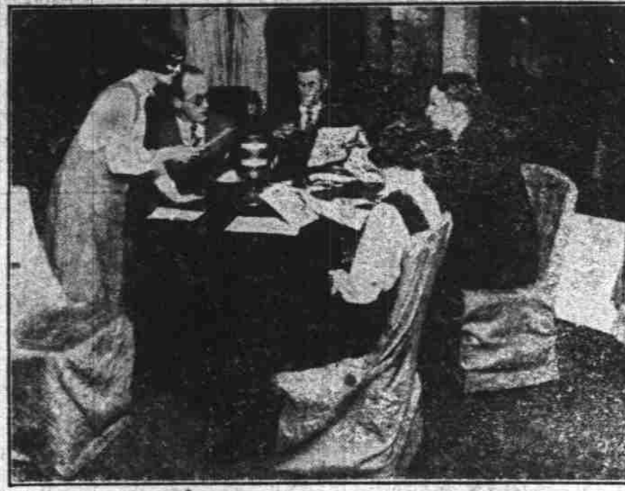
Educators have endorsed the new feature of the Crosley WLW station which provides lessons for the elementary grades in school via the modern way of broadcasting. Prominent educators give the lessons at nine o'clock in the morning. A number of students are shown in the studio taking part in the lessons.

the price reduction statement is as follows: