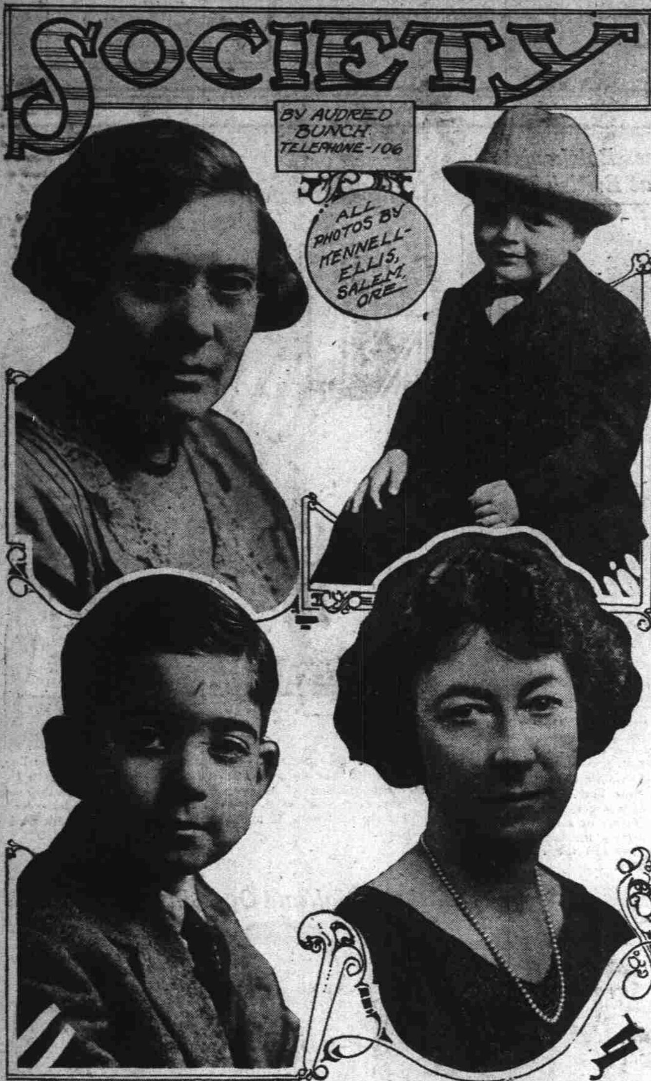
BY AUDRED BUNCH TELEPHONE 106