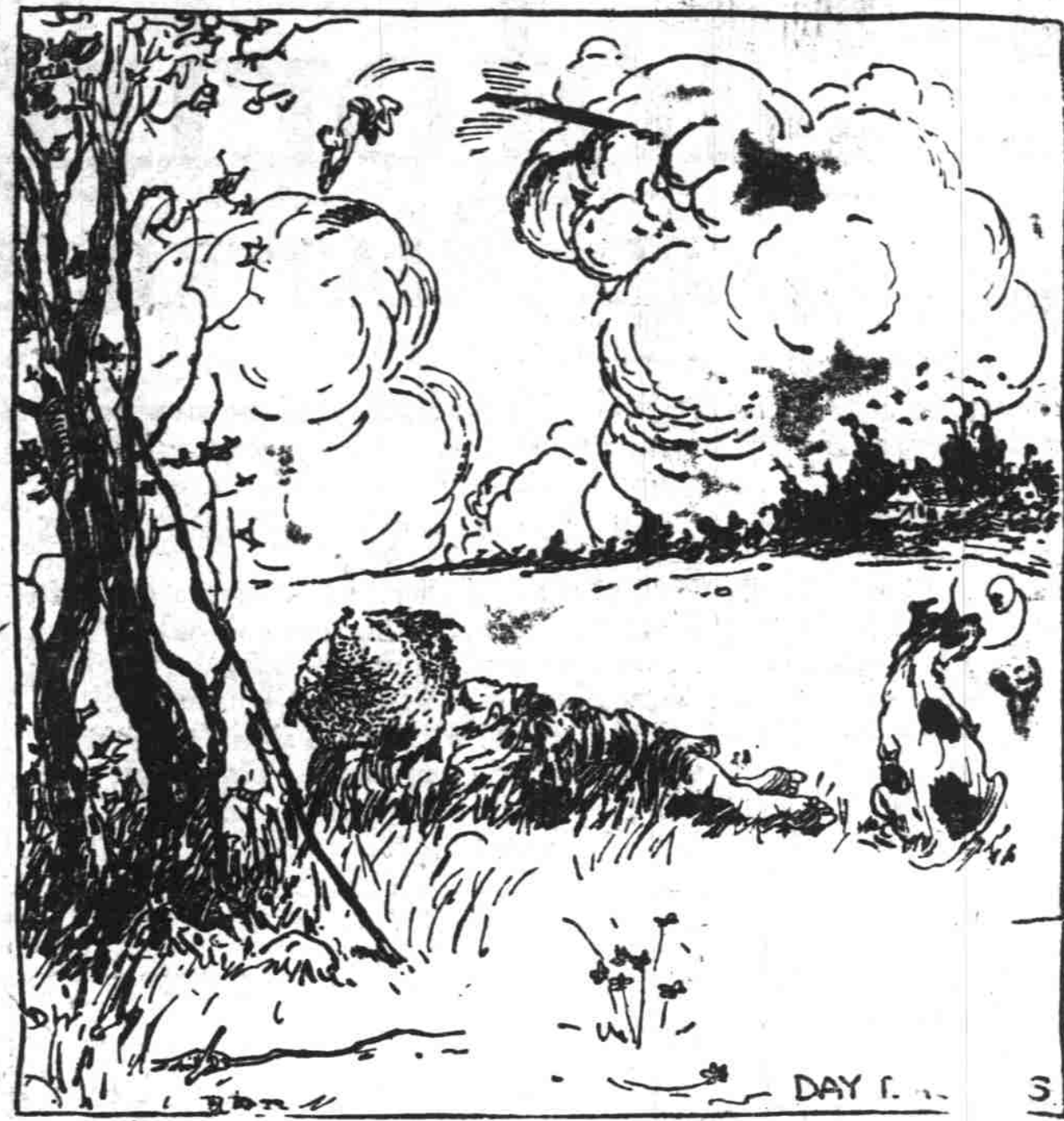
DAY 1. S