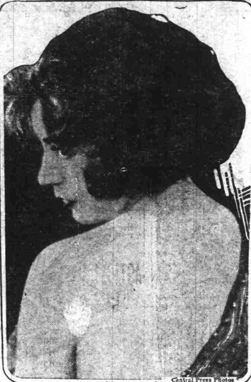
Divorced from Tom Moore, film leading man, Renee Adoree (above), screen heroine, is acquiring a new husband, Douglas Gilmore, also of the movies.