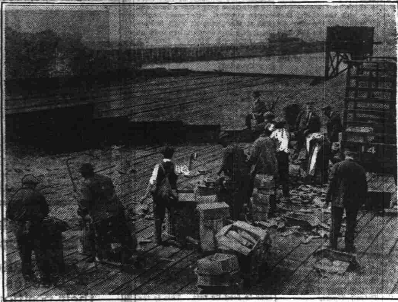
No tears were shed when prohibition officers destroyed $250,000 worth of seized liquors at the U. S. army base, Brooklyn, N. Y., because the performance was not staged in public. Trucks brought up the doomed drinks, bottles and containers were smashed and the contents dumped into the bay.

the crankcase. Actual oil consumption, as measured at the Hupp factory, was less than three quarts.