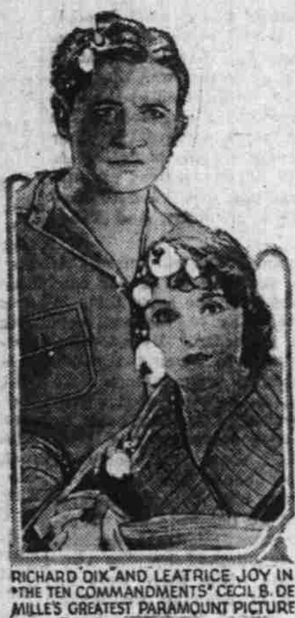
RICHARD DICK AND LEATRICE JOY IN "THE TEN COMMANDMENTS" CRYSTAL BALL THEATRE'S GREAT PARAMOUNT PICTURE

The answer to those of the theatre goers who have gained the impression that "The Ten Commandments" is principally a moralistic production devoid of entertainment is contained in the multitude of criticism that have hailed it as one of the most absorbing and interesting stories that has ever been offered to the moving picture public.