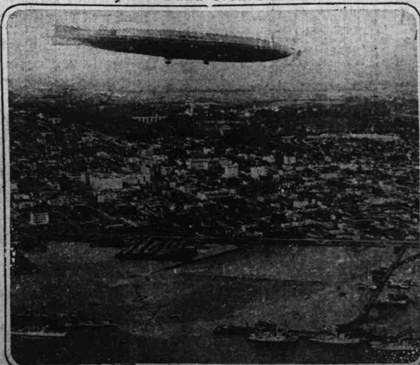
The navy department is preparing to move its dirigible base from Lakehurst, N. J., to San Diego, Cal., where an airport will be constructed at a cost of many millions of dollars. The photo shows the city from the air. Inset, the U. S. S. Shenandoah, one of Uncle Sam's two largest dirigibles which with the U. S. S. Los Angeles, will be at home at San Diego in the future.