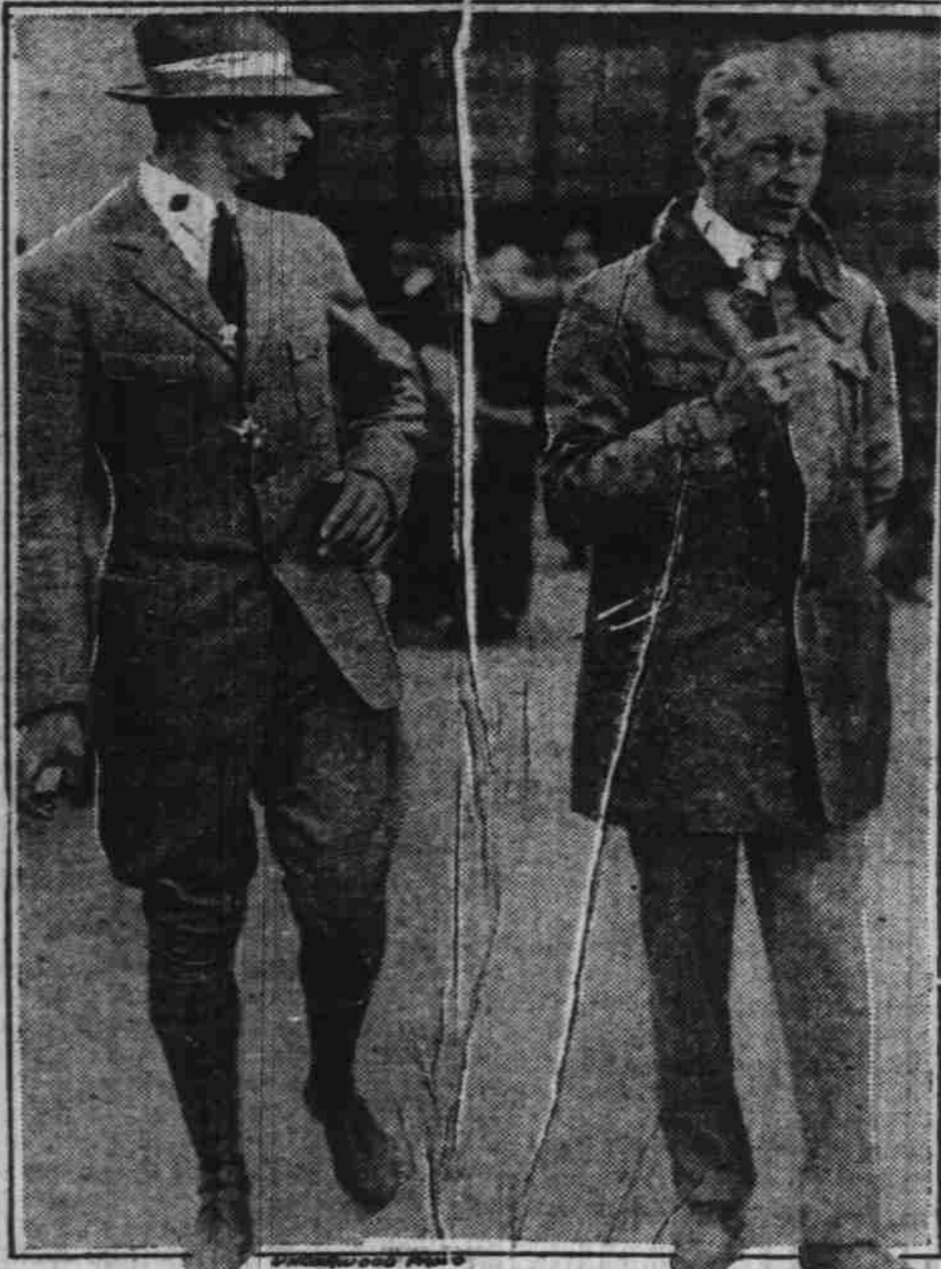
William Hohenzollern, Jr., who used to be crown prince of Germany, and his son (left), are still nursing high hopes and aspirations, it is reported, despite the rather unenthusiastic reception they were given when they appeared at the annual national aviation meet at Berlin as private citizens. They are seen watching events on the program.