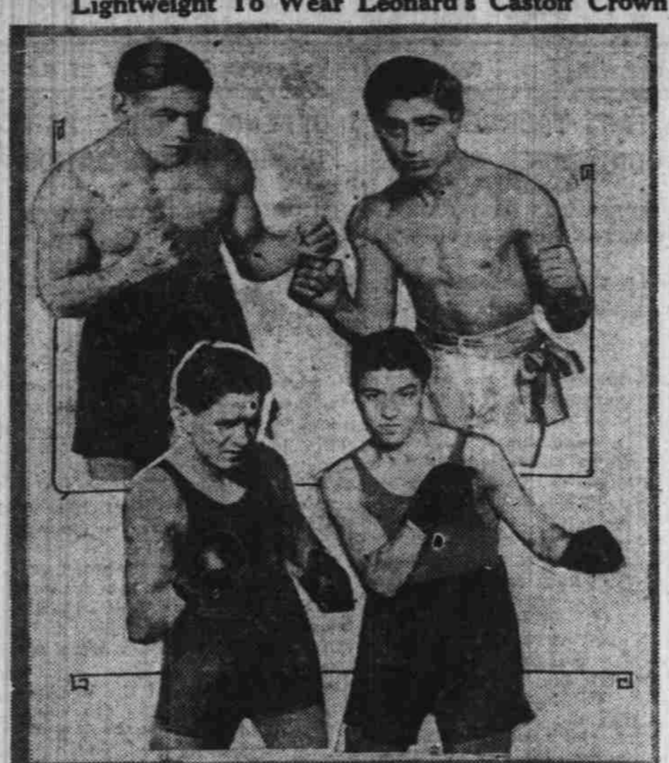
Benny Leonard's voluntary retirement as champion of the world has resulted in great activity in the lightweight division. Here are four of the prominent contenders.