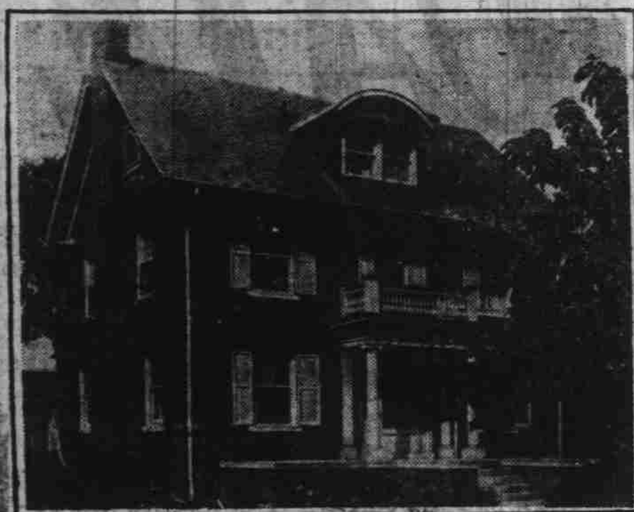
THE WAPATO DESIGN A724

Most men of moderate means who eventually his own home. For a have not already provided homes for their families have, stored away somewhere back in the card index file of their brains, a fairly good idea of what their ideal home will be. Probably it hasn't taken definite form but in a general way the outline is there. They know about how many rooms they desire, have figured out the approximate arrangement, and have made mental note of this and that little extra convenience they mean to have incorporated; and in fact are all set save for the most vital point of all, the making up of their mind definitely and finally to build that home.