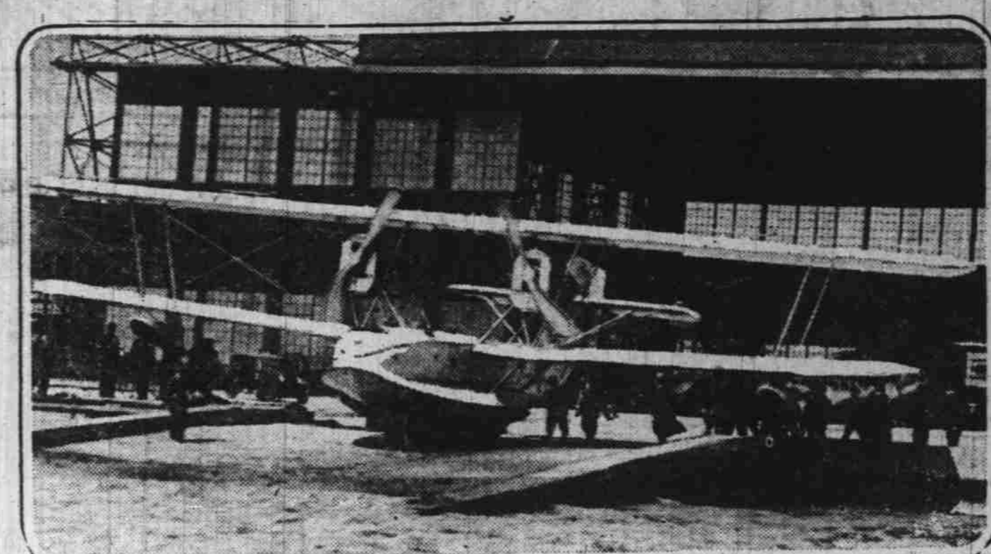
Again the U. S. navy has shown the world the way in aircraft design. Much interest is being evinced by other nations in a new type of hydro-airplane cruiser developed by the naval air service. It has a cruising radius of 3,000 miles, travels at 128 miles an hour, and has a gasoline tank capacity of 1,285 gallons. Naval officers hope to get official consent to make a non-stop flight from San Francisco to Hawaii in it. The plane is seen taking the water at League Island Navy Yard, Philadelphia.

There is a market for about 8,000 head of these horses annually. They are bought by an eastern concern to be slaughtered and