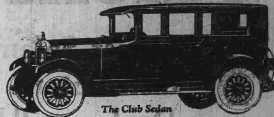
The Club Sedan

In your own interest, four considerations should govern you in the selection of your next car.