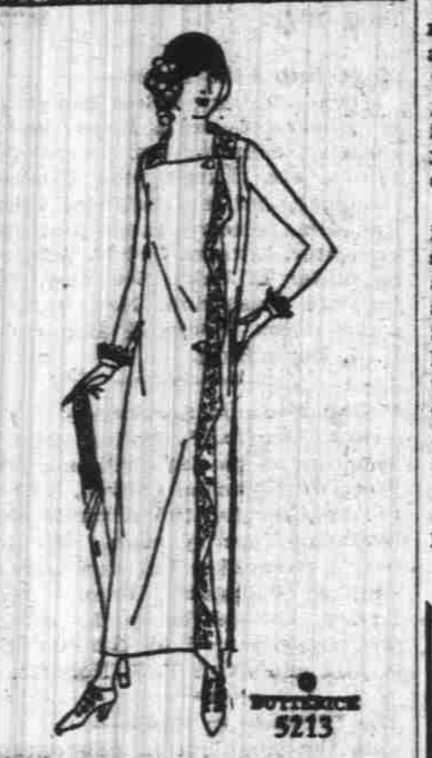
Sleeves are less than nothing in the life of Summer frocks intended for country gardens or city roof-garden restaurants.

It is a comforting warm-weather fashion that sheds its sleeves in its silk crepe and crepe de Chine dresses intended for private life in the country or the semi-public life of city roof-restaurants. The long, close sleeve is also used for this same type of ballion dress made of silk alpaca with the full, which follows the Russian closing, of printed crepe de Chine. One can also take advantage of the two sides of crepe satin by using the shiny side for the dress and the dull for the sleeves or vice versa. The short glove is worn with both the long sleeve and the sleeveless dress.