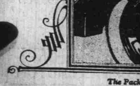
The Packard Six five-passenger sedan, $2585 at Detroit