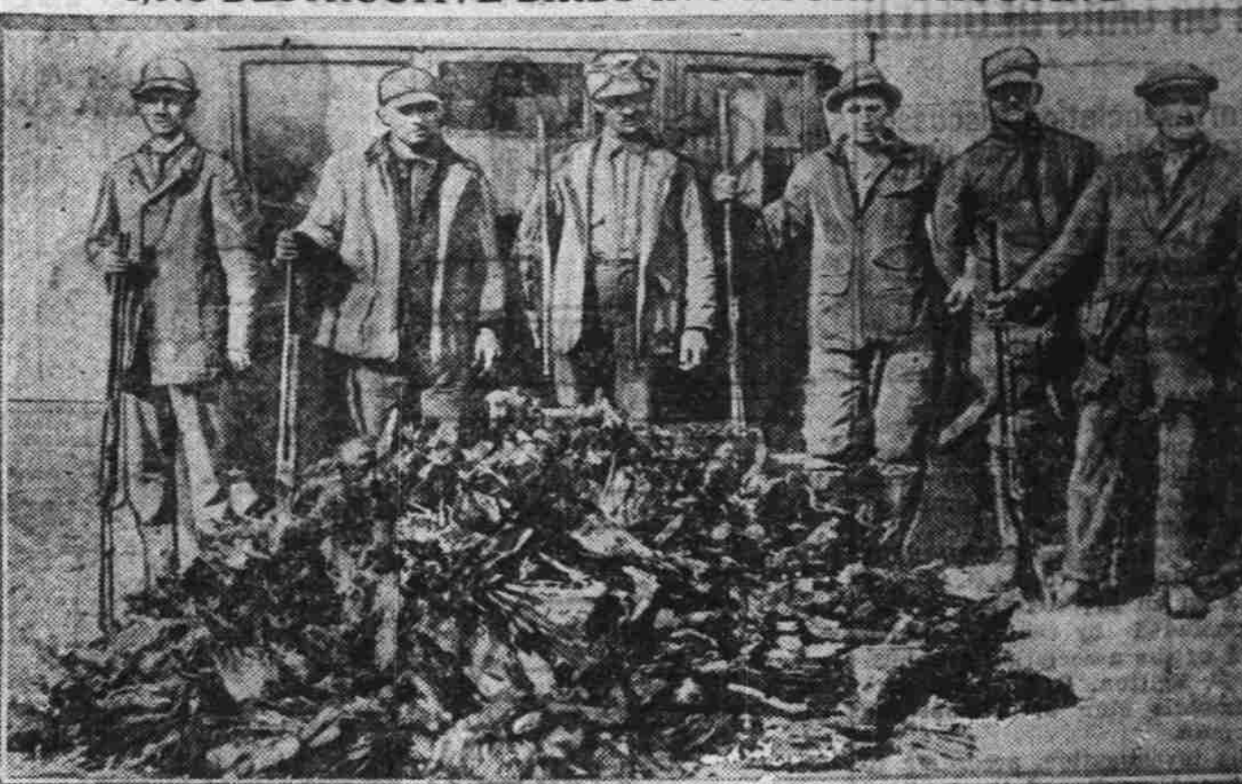
Members of the Isaac Walton League of America organized teams in a campaign to exterminate crows which had not only menaced farmers in the Middle West but had

been killing small game, including quails and rabbits. These teams attacked the birds in their roosts at night. The team pictured above, representing the Chickasha, Oklahoma, Chapter of the league, was the winner, bagging 1,075 crows in three hours' shooting.