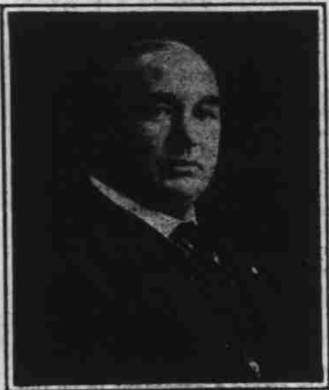
state Fire Marshal