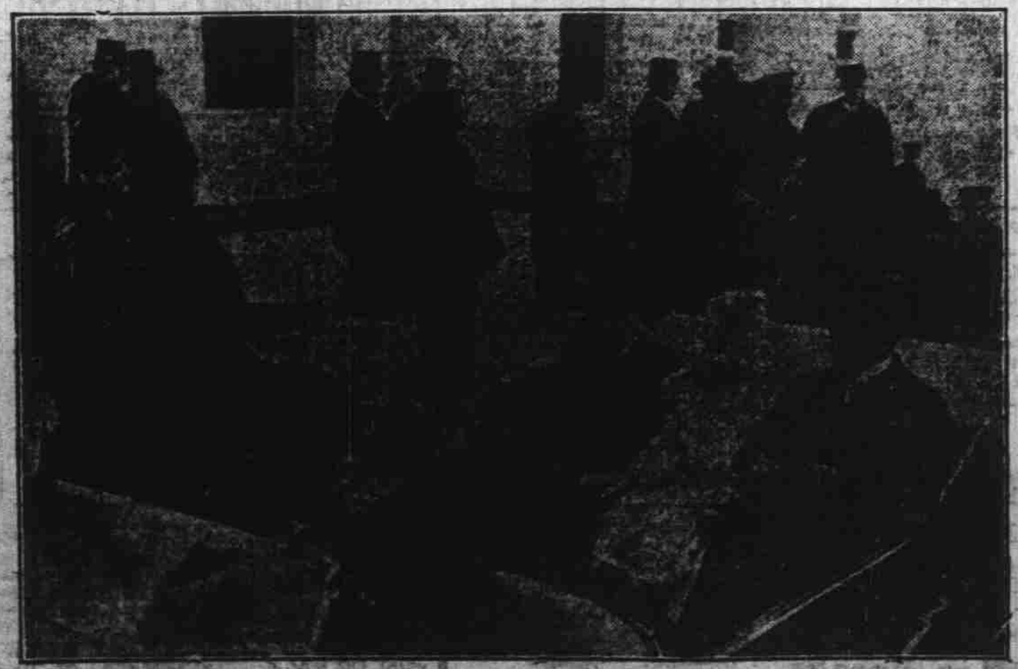
President and Mrs. Coolidge with Senator Curtis leaving the White House for the inauguration at the Capitol. The photograph was transmitted over the telephone lines.