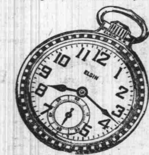
The New "B. W. Raymond"—Elgin's finest $55—One Dollar Cash

Here is the finest collection of Railroad Watches in the Northwest. And the Burnett plan enables you to buy any one on payments so small as to be as "easy as eatin' pie" as the schoolboy would express it.