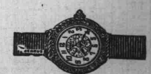
Special Bracelet Watches

Ladies' white gold filled Bracelet Watches with sixteen jewelled movement—in the style shown in the sketch. A dainty and a beautiful watch which cannot be matched for less than twenty dollars outside the Burnett organization. Featured during the Annual sale at