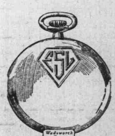
The Burnett Jewelry Stores take the broad stand that Everybody is entitled to Credit unless they have already shown that they are NOT!

Here is the time-honored Howard Watch which is sold in every first-class jewelry store in the U. S. A. at $60 cash. The makers fix the price and print it plainly for all to see. You may have the case monogrammed as our artist has suggested (no extra charge). Take the Howard along for a dollar bill. Pay the balance as you are paid—a dollar a week will do!