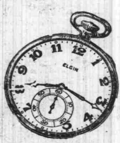
Elgin Special $1 Down

No money needed—none asked for! If you decide to keep it after a thirty day trial—Pay us as you are paid—a dollar a week will do!