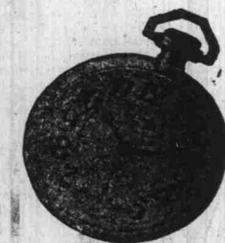
The Gold Medal Watch

Note—We consider ourselves lucky to be able to offer a twenty-one jewel watch for less than sixty dollars!