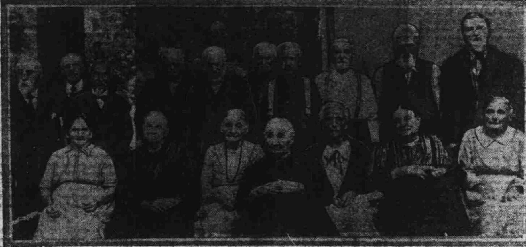
Above is pictured a group of the residents of Saltdarburg, Pa. It is doubtful if there is another town in the world that can boast of so large a percentage of Octogenarians and Nonagenarians.

these messages are termed "lectures," yet they are full of evangelistic spirit and power and appeal.