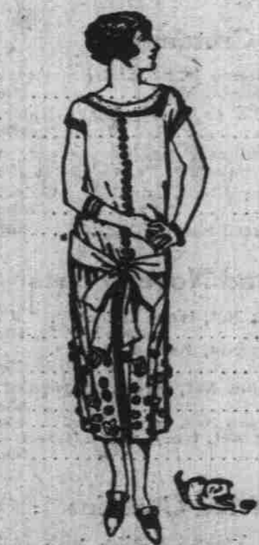
IRENE CASTLE CORTICELLI FASHIONS The LUCRETIA Model