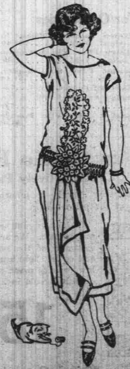
IRENE CASTLE CORTICELLI FASHIONS The ARVILLA Model

The "Lucretia" model—(above)—A tunic effect with a bow in front is charmingly employed—the net yoke and leather ornaments are happy touches. Developed in Corticelli crepe Tremaine.