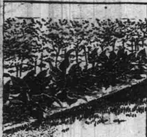
EDGE OF RHUBARB AND ASPARAGUS AS A SCREEN FOR THE VEGETABLE GARDEN.

Landscape architecture, the home in relation to its surroundings, has become almost as important a factor in building as the construction of the house itself.