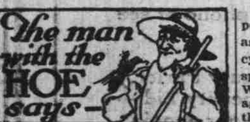
Figure on planting dates as nearly as you can guess the weather and don't try to do it all at once.

Admit it must be. Since, because of the standards of morality in practice today, this