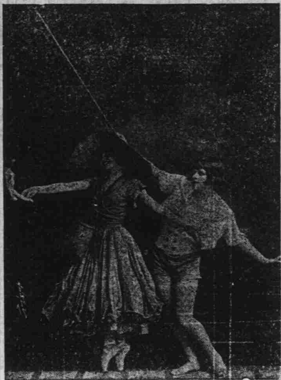
A scene from the dance concert as programmed for Wednesday evening, February 18, displaying one of the many studies in the combination of shapes and colors to dance rhythms.