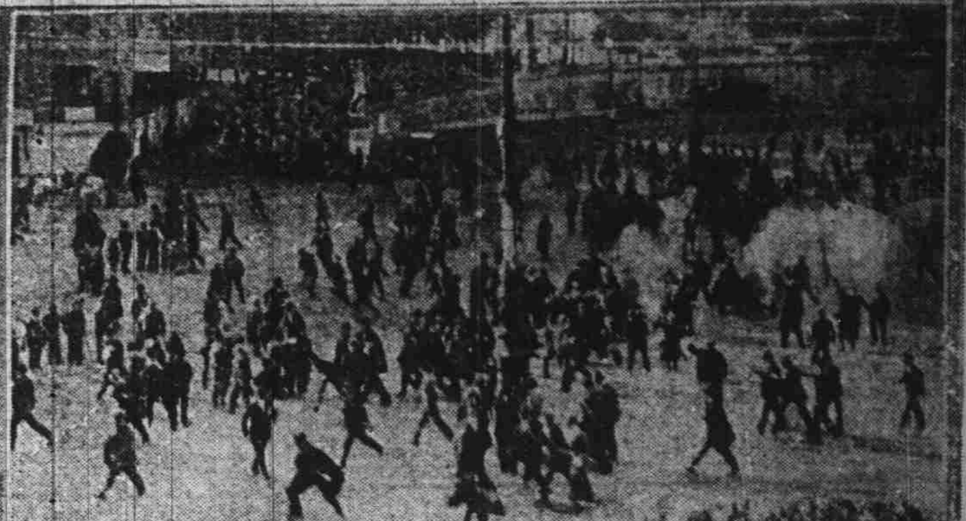
Following the promise of Premier Mussolini that he would "clean up" the political situation within forty-eight hours, clashes took place in various sections of the country and government forces were rushed to suppress threatened uprisings. The above photograph shows a clash between Fascist troops and Garibaldians on the occasion of the celebration of the Armistice last November, and the recent clashes, in which three persons were reported killed and many wounded, were of a similar nature.