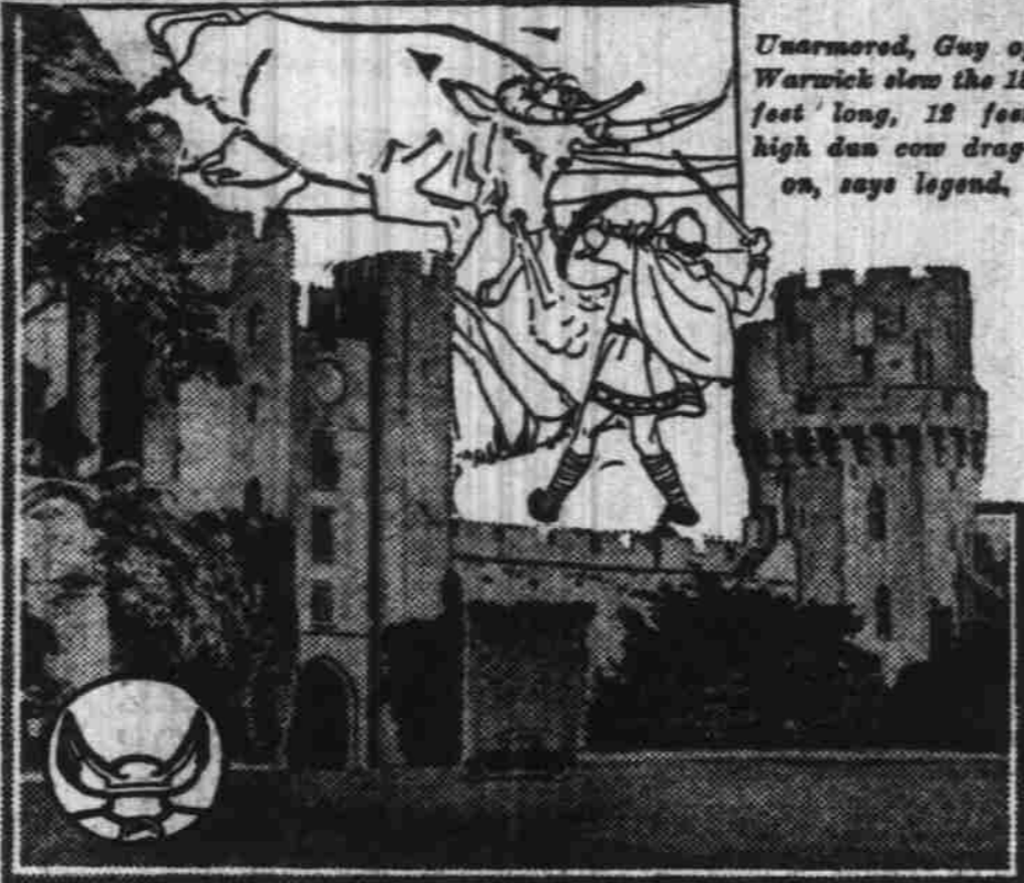
Unarmed, Guy of Warwick slew the 18 foot long, 18 feet high sea cow dragon, says legend.

Warwick Castle at Warwick, England, an easy motor trip from London IT WAS Scott who said of Warwick Castle at Warwick, England, "the fairest monument of ancient and chivalrous splendor which yet remains unimpaired by time." This marvelous castle which has attracted hundreds of American motor tourists in England to Warwick, stands on a rock overlooking the Avon. It is said to have been founded in 915 by Ethelred, the daughter of Alfred. In the war with the barons in the time of Henry III it was destroyed except