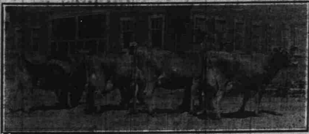
A Group of Willamette Valley Buttermakers

The Salem district is on the way to a flax and linen industry of $100,000,000 annually, and em-