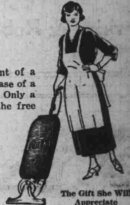
The Gift She Will Appreciate

It's a fact. We will positively make you a present of a complete set of famous attachments with each purchase of a Grand Prize Eureka between now and Christmas. Only a limited number of Eureka's can be secured with the free attachments and we urge you to phone us at once and we will deliver our latest model right at your door on a free cleaning trial. Then test for yourself the speed and thoroughness of Eureka cleaning.