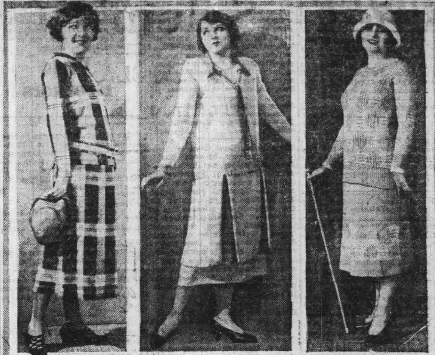
At the left is an attractive slipper suit. The gown shown in the center is of white and coral bengaline. The sweater suit at the right is in blue and gray.