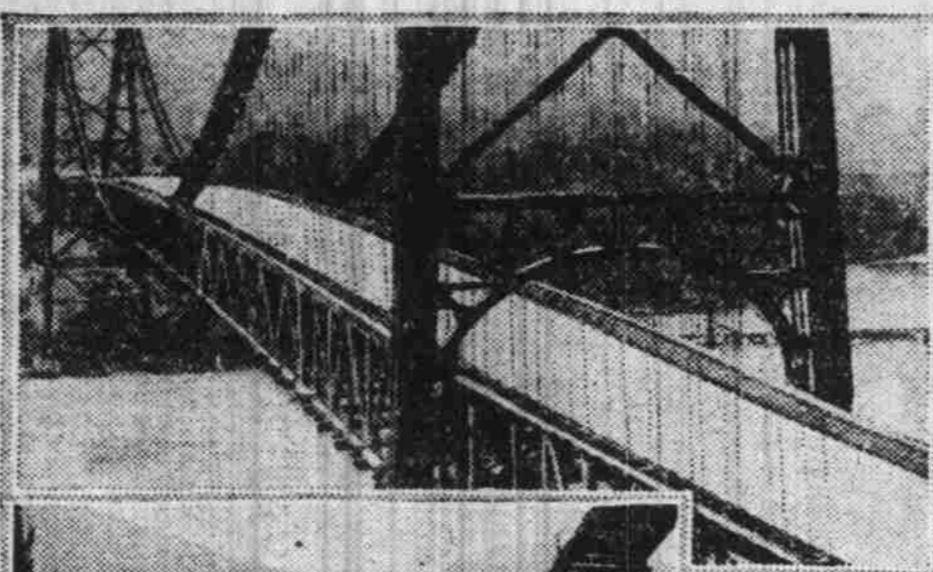
The New Hudson River Bridge at Bear Mountain now open. Last work was laying of a 38-foot wide asphalt roadway.

D RIVERS of automobiles, tourists and truck drivers in every part of the country and especially those of New York State and New England had special cause for giving thanks on Thanksgiving Day this year—the opening of traffic of the great, new highway suspension bridge across the Hudson River above New York City, where Bear Mountain and that other hump of the Peckskills, Anthony's Nose, face each other from opposite banks.