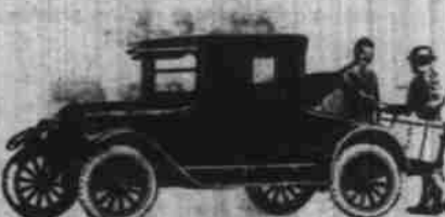
Superior Utility Coupe, $830 F. O. B. Salem