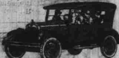
Superior DeLuxe Touring, $780 F. O. B. Salem