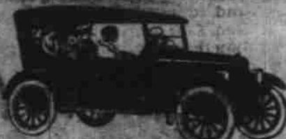
Superior Touring, $638 Delivered in Salem

When may we show you the different models and explain how easy it is for you to get, use and pay for—