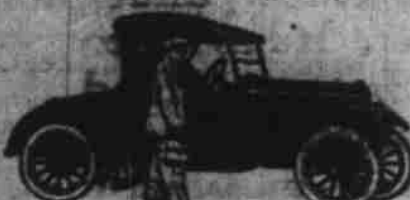
Superior Roadster, $620 F. O. B. Salem