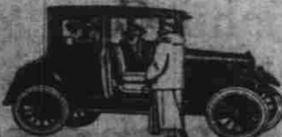
Superior 4-Door Sedan, $920 F. O. B. Salem