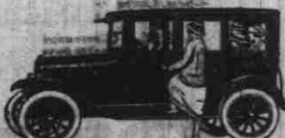
Superior Sedan, $990 F. O. B. Salem