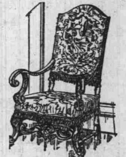
High chairs of mahogany or walnut. Upholstered in a fine grade of tapestry. The folks would appreciate a gift like this. $26.75 to $32.50