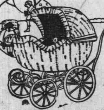
A real wicker buggy for sister's doll. Big ones, just like mother's and made by the same factory. $1 down makes it easy to buy. $15.75 to $17

DOLL BUGGIES—VANITY DRESSER—ELECTRIC TOASTERS—END TABLES