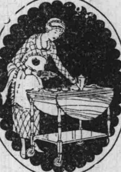
Tea Wagons with straight or side leaf lifts to form a table. These come in mahogany. Artillery wheels with rubber tires. $22.50 to $35