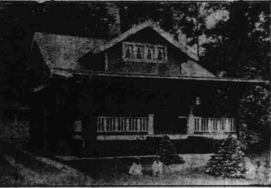
THE CHICKASAW—DESIGN A 525