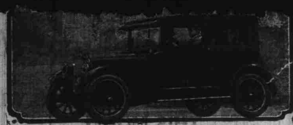
New Oldsmobile Six Coach. The body is by Fisher and seats five passengers.

The coach has more than the ordinary amount of head room, being four feet from floor to top. It is 70 inches from the instrument board to the back seat. This seat is 22 inches deep and 46 1/2 inches wide. There is an 18 inch space between the front of the rear seat and the of the Pullman type driver's seat. The seats have high grade springs and the cush-