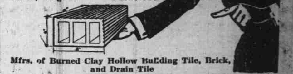
Mfrs. of Burned Clay Hollow Building Tile, Brick, and Drain Tile

SALEM BRICK & TILE CO. Salem, Oregon Phone 917