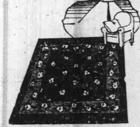
9 x 12 Tapestry Rugs $28.35

You're bound to admire the real beauty of these handsome rugs, of a heavy quality that will give years of Service. Better act promptly and get first selection of the new patterns and colorings at this low advance Fall price!