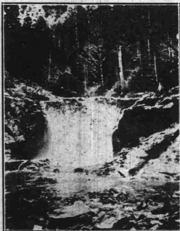
On the Santiam Near the Lotz-Larsen Mine