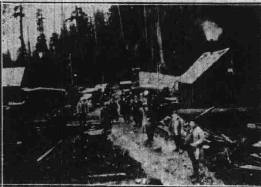
Bank Houses, Mess House and Other Buildings at Lotz-Larsen Mine