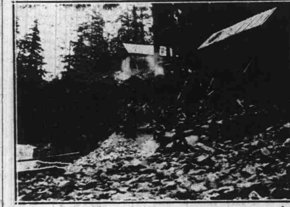
Tunnel Entrance and Air Compressing Machine Rooms of Minnie E

stands values. He has behind him a long period of experience in getting out the precious metals and marketing them. He is anything but a dreamer.