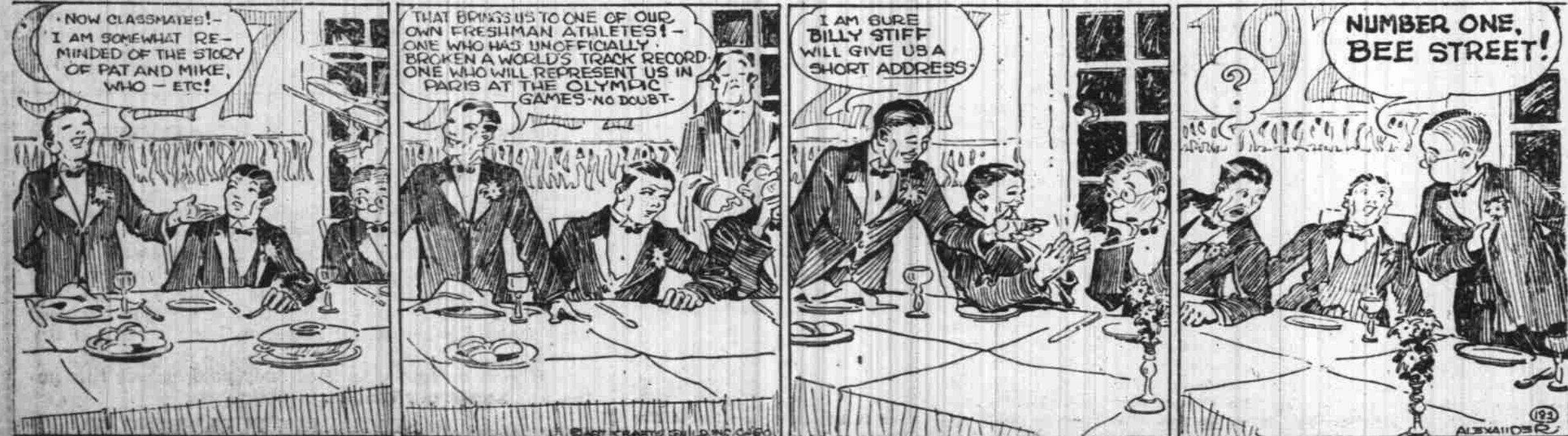
"NOW CLASSIFIED! I AM SOMEBODY RE-MINDED OF THE STORY OF PAT AND MIKE, WHO - ETC!"

This wrong-number business might be much worse. Suppose telephone girls worked in shoe stores.