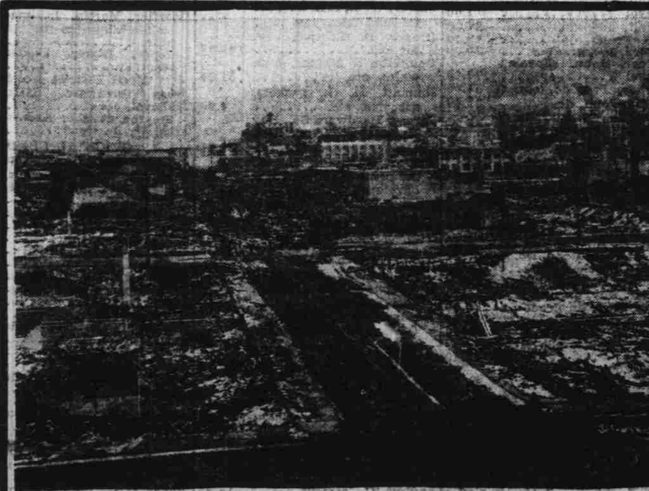
Astoria After The Fire December 8th, 1922. Looking Up Commercial Street.

Only a few miles away on a continuation of this highway, are the famed Clatsop beach resorts, Seaside, Gearhart and North beach resorts, where surf bathing, swimming, fishing, golfing and other forms of recreation are on the daily programme.