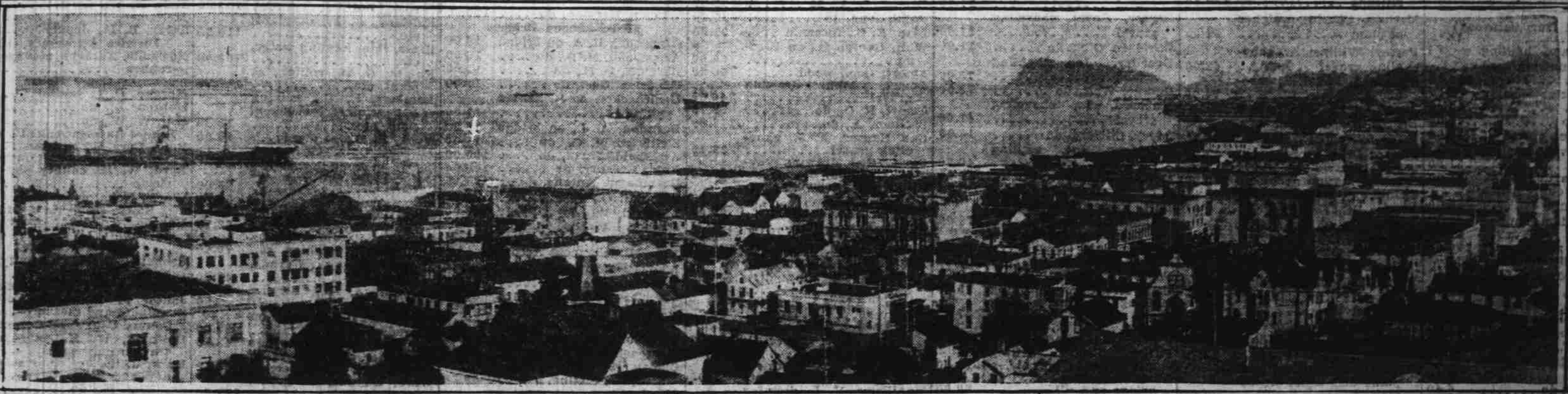
Astoria Before The Fire December 7th 1922.

A programme of entertainment has been arranged for the three-day celebration, one feature of which will be dedication of the new Elks