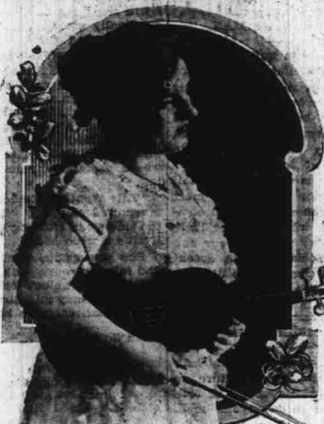
Local music teacher who leaves for a summer's study in New York City.