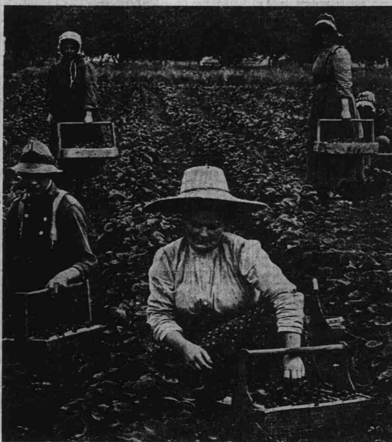
Picking a field of Marshall strawberries in the Salem District.