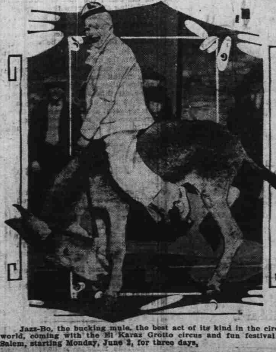
JACK-BO, the bucking mule, the best act of its kind in the circus world, coming with the El Karas Grotto circus and fun festival to Salem, starting Monday, June 3, for three days.