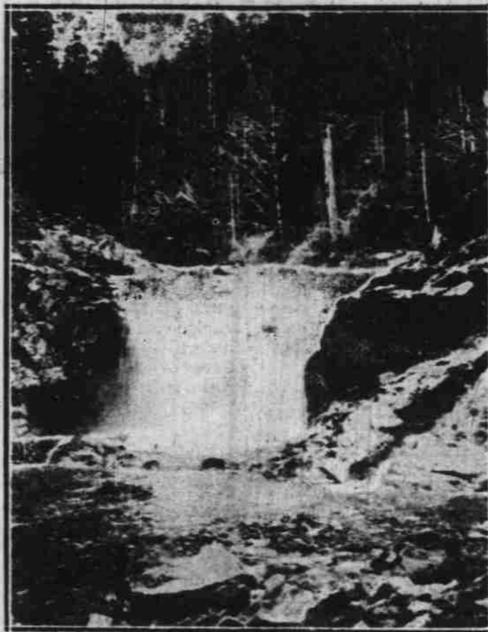
On the Santiam Near the Lotz-Larsen Mine

Presume that he was fortunate in selecting the highest quality land, and he has had success in selecting a type of crop that will do well in his locality, and that, hail, rain, drought, fire, grasshoppers, disease infection, and any one of a dozen other calamities pass his crop by and he has raised a bumper crop of something that he has estimated to be a "sure thing," there is ever the final risk that is ever present—market and profitable prices. And the writer has