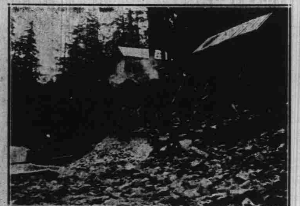
Tunnel Entrance and Air Compressing Machine Rooms of Minnie E.