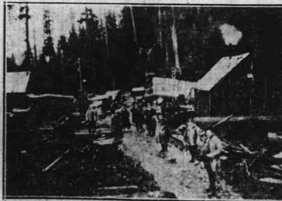
Bunk Houses, Mess House and Other Buildings at Lotz-Larsen