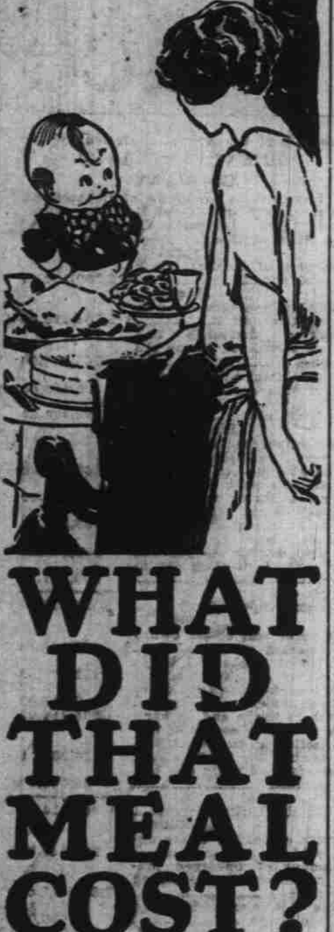
THE OREGON STATESMAN, SALEM, OREGON

your time and laborand it's ruined all bedred Jaeger. cause of heavy bread or a soggy cake. You chose "There Are Birds in the may have saved a fraction of a cent by using an unreliable baking powder-but ruined