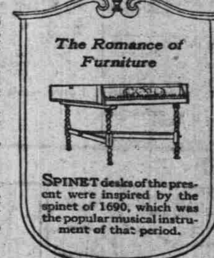
The Romance of Furniture

There is no better time than this to renew this holy of holies—and there is no better place than here!