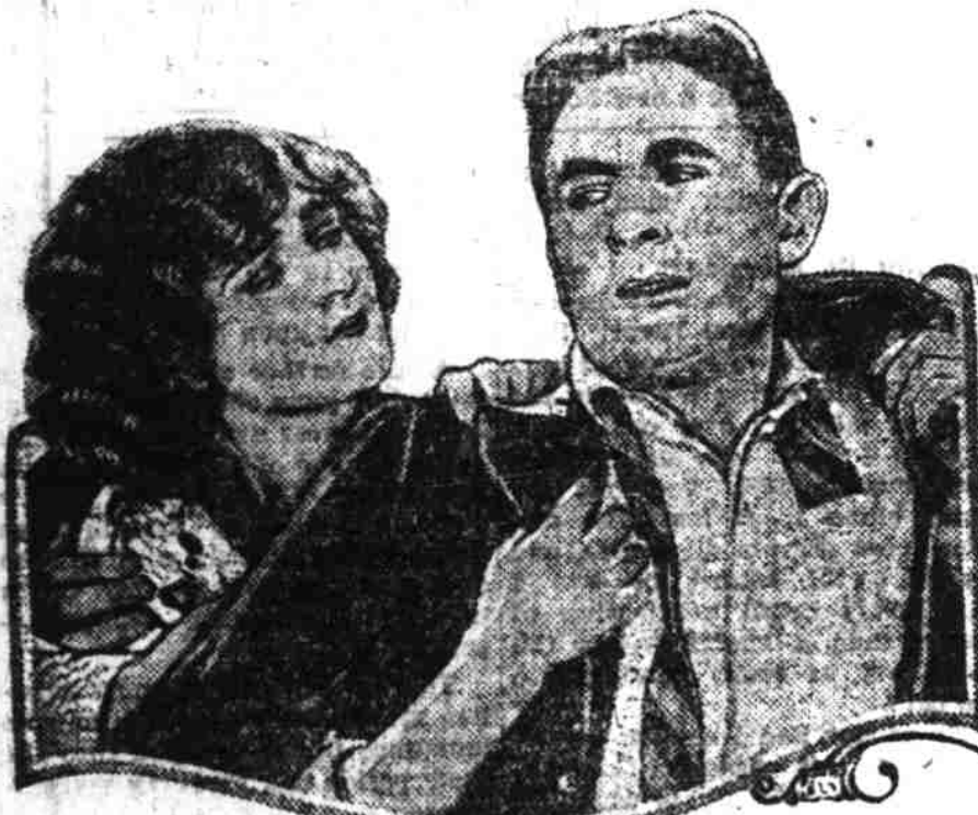
Sylvia Breamer and Owen Moore in "Her Temporary Husband"