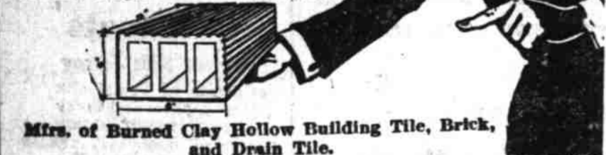
Mrs. of Burned Clay Hollow Building Tile, Brick, and Drain Tile.

SALEM BRICK & TILE CO. Salem, Oregon. Phone 917