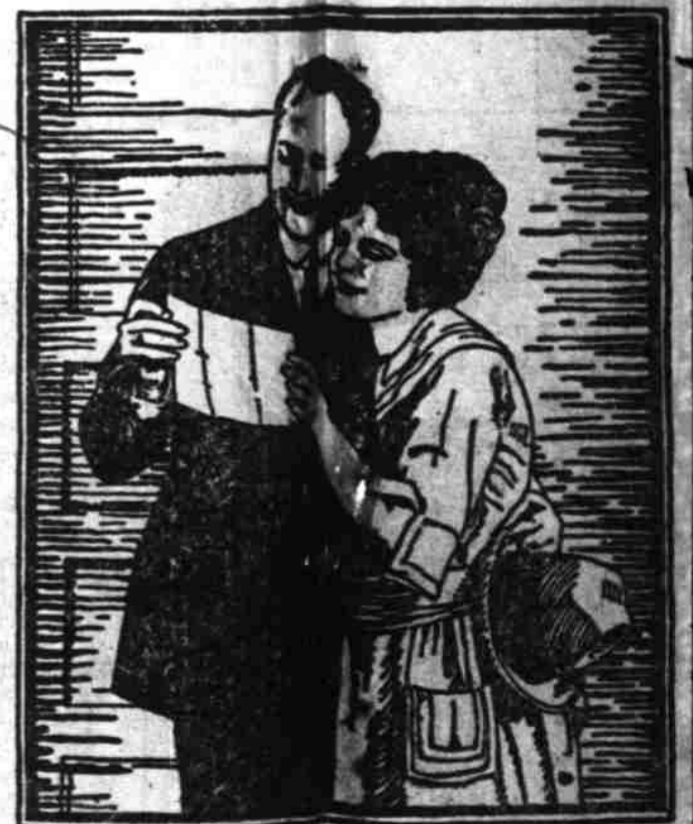
Send in the coupon and receive a copy of our new booklet, "The Woman in the Case." Do it now.

Nowadays you can become one of the owners of a great business institution, and put that organization to work for you.