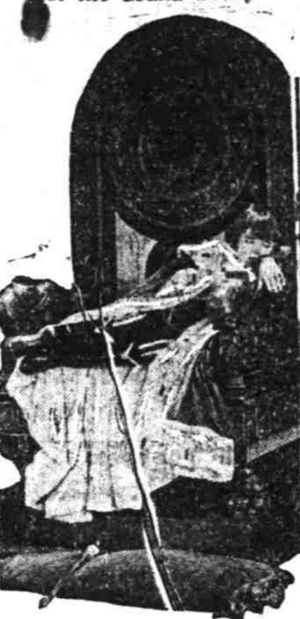
JACKIE COOGAN in "LONG LIVE THE KING"

loaded on several occasions and one of them was once discharged.