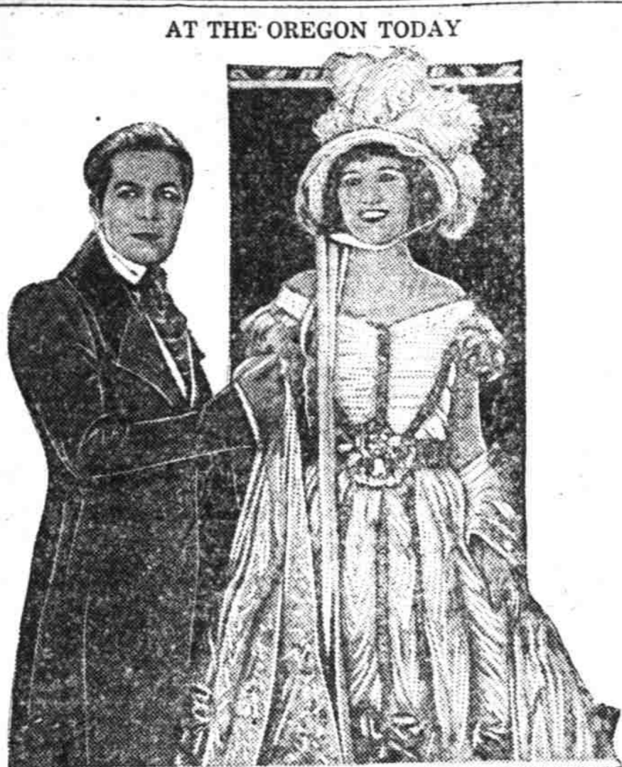
Marion Davies and Harrison Ford in Cosmopolitan's Production of "LITTLE OLD NEW YORK" Distributed by Goldwyn-Cosmopolitan