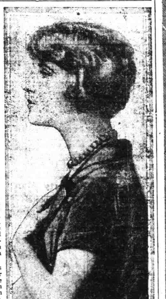
JUSTINE JOHNSTONE, International beauty and actress who has just

value of a comfortable corset aids me materially in training my figure along trim lines," "The woman who