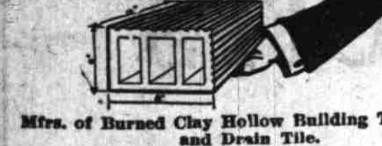
Mrs. of Burned Clay Hollow Building Tile, Brick, and Drain Tile.

SALEM BRICK & TILE CO. Salem, Oregon. Phone 917