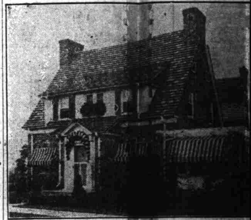
The Hiawatha—Design A-705

JUST as a man's exterior appearance is a consequence of his mind, so is the exterior appearance of a house a consequence of the materials and the construction. What is the beautiful finish of the structure and its location, of course, be matters beyond its own control. The man of average means obviously cannot build a large and showy house or attract a lot in an expensive neighborhood. But no matter how small the house is decreed by circumstances to be, and no matter what it is placed, it can bear indications of refined taste and proclaim to the world its owner's good judgment.