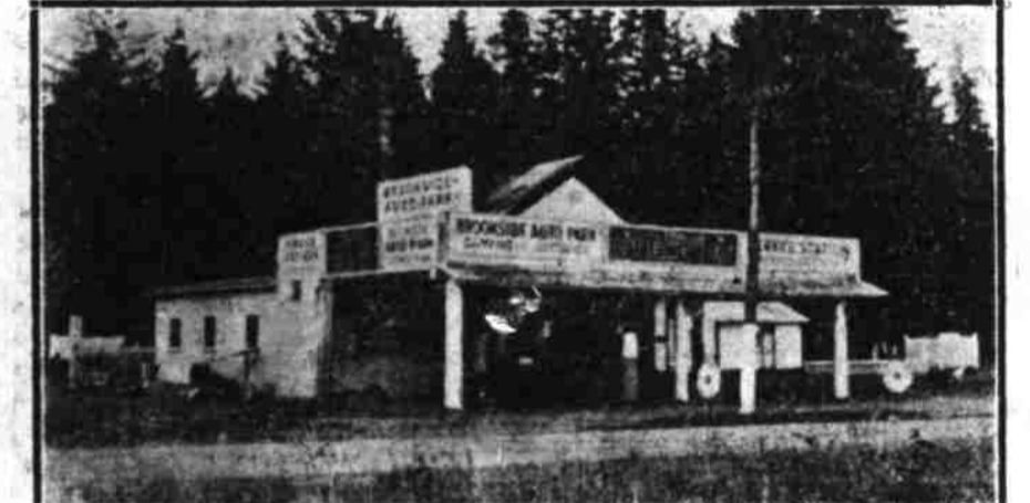
Entrance to Brookside Auto Park Near Salem

tensive improvements in the early spring. Among other things that will do much to make this the leading park on the highway will be the erection of several score